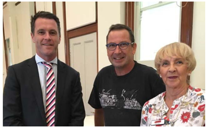
Chris Minns MP for Kogarah

Chris spoke about the importance of art and expressed his support for our society and his encouragement for our continued engagement with the community.