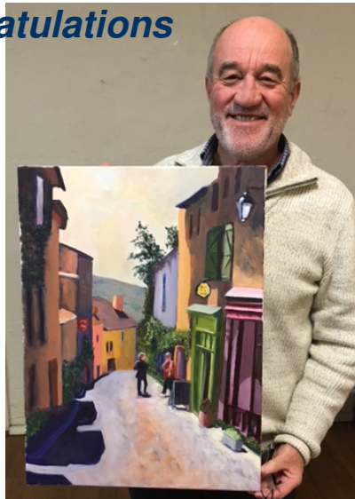
Jim West "French Village"