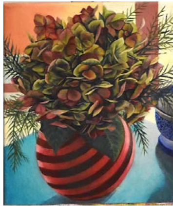
Bronwen Bassett 'Hydrangeas'