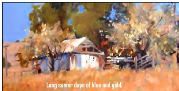
Long summer days of blue and gold.