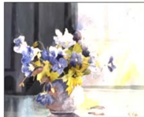
Watercolour by Myrle King Myrle King Award for Traditional still life