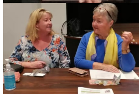
Welcome at the desk