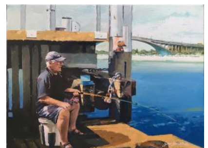
Parramatta River Angler